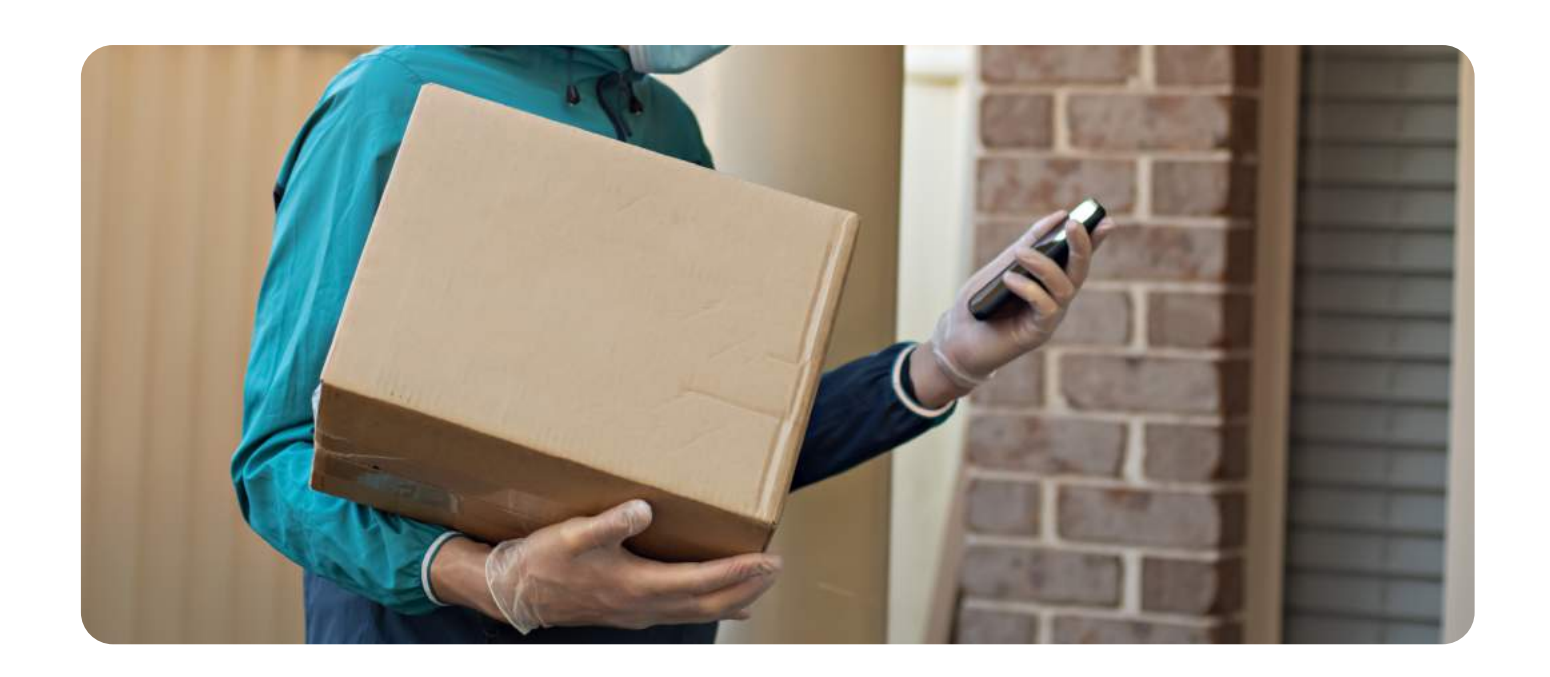
Step 2: Prepare a D2C Segment

With consumers more motivated to shop from home, brick & mortar stores experiencing shortages on CPG goods, and disruptions to distribution networks causing increased delivery times from popular online shopping hubs, more shoppers are buying directly from manufacturers.